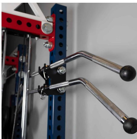
Lat Bar Storage (deluxe)