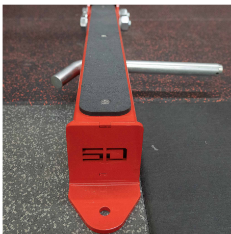
On Front Feet