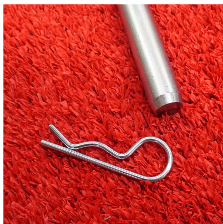
Cotter pin to secure