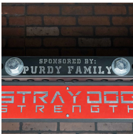
Up to 17 Characters