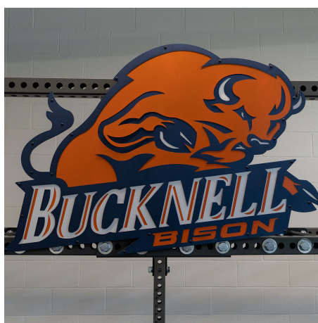
Oversized Logo Option