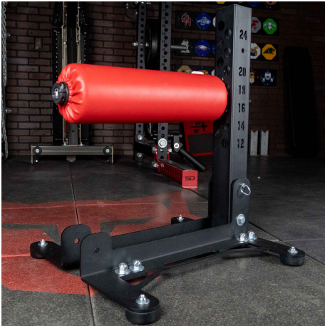
Add Any 1" Roller