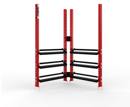
43" DB Trays