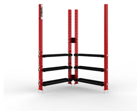
43" Flat Trays