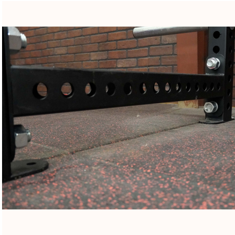
3.75" underneath for feet