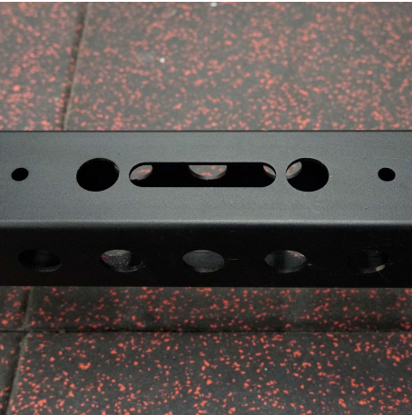
Guide rod hole pattern