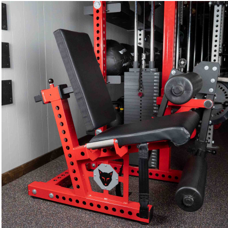
6.5" x 6.5"