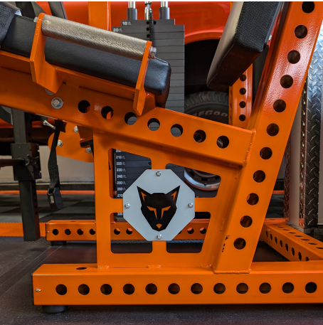
Add Custom or SD Logos