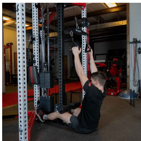
Add to Cable Columns