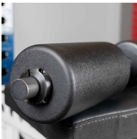
Black Injection Rollers Only