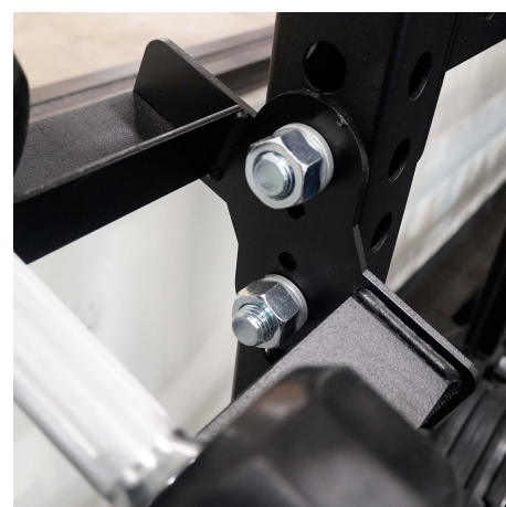
Sticks 4" out back