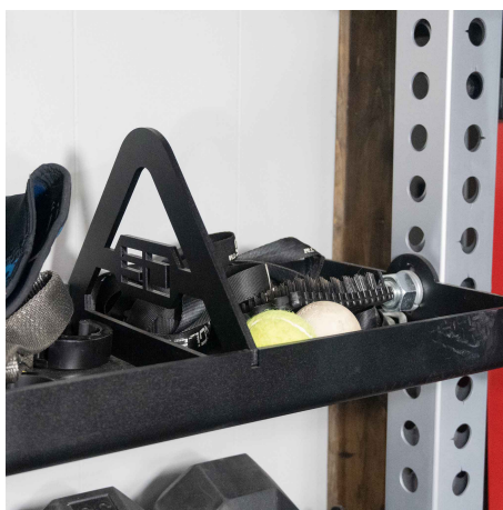
Add Divider to separate items