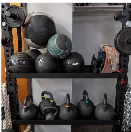
43" Trays have 3 Slots