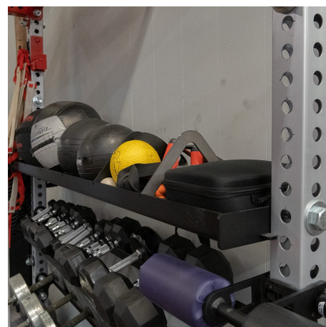
72" Trays have 5 Slots