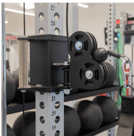
Stainless Steel Knurled Handle