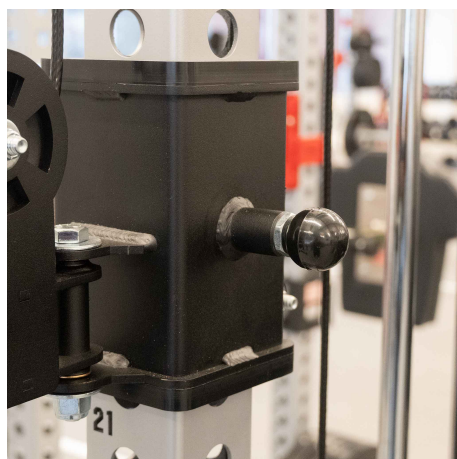
Pull Pin Adjustment