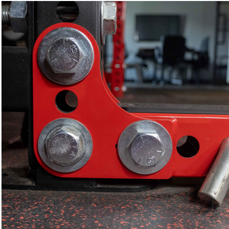
Strong Steel Plate Bracket Construction