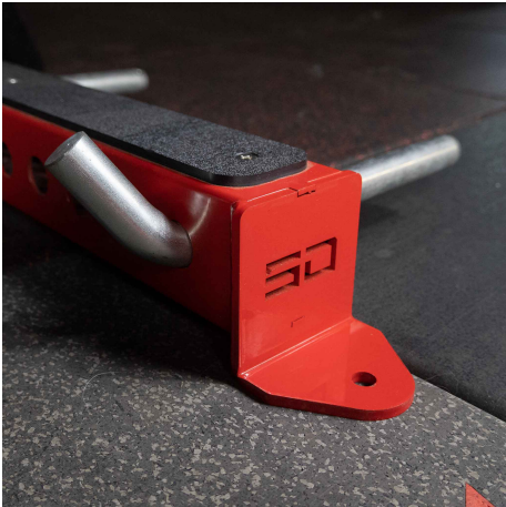
Bolt Down Tab