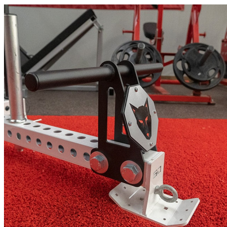
Bolts on with 2 Bolts