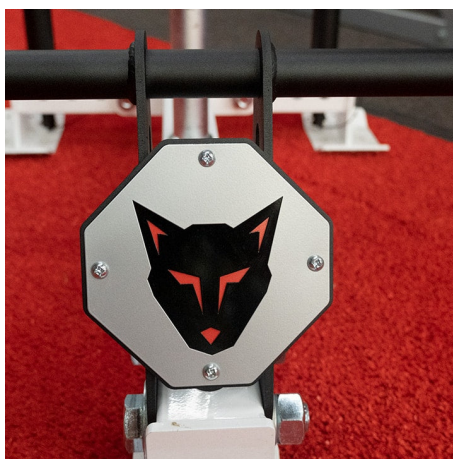
Laser Cut Logo Spot