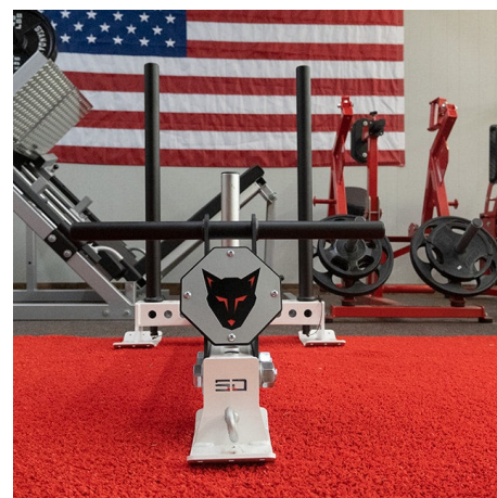
22" Wide Handle