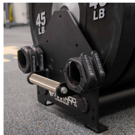
Laser Cut Logo Spot