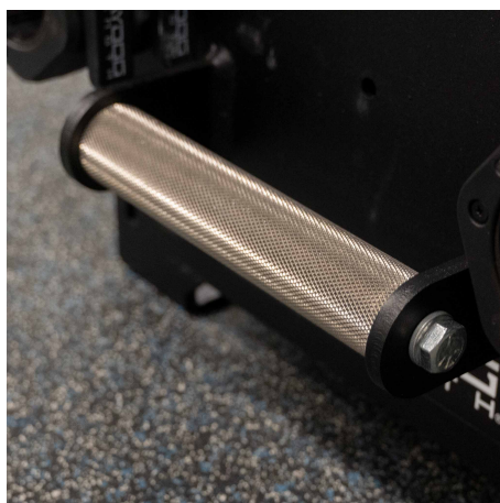
Stainless Steel Handle