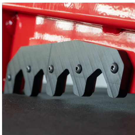
Plastic Add On