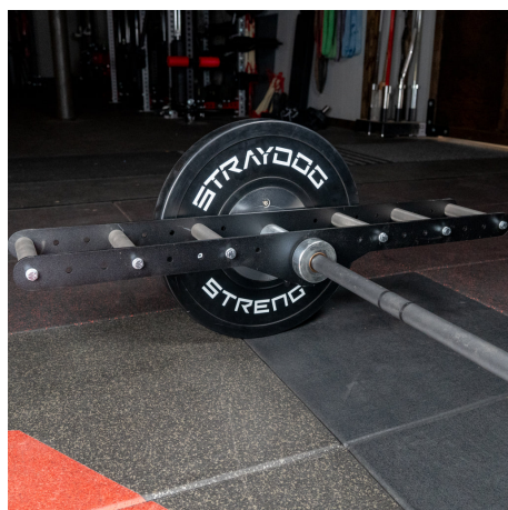
Landmine Hole for 2" Bar