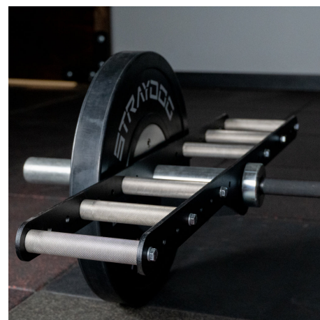
8 Holes per side 2" Apart