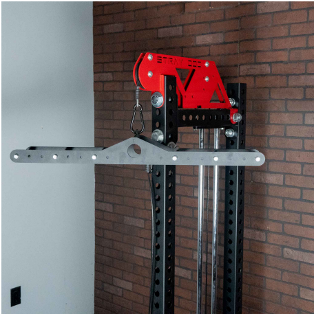
High Pulley and Lat Bar