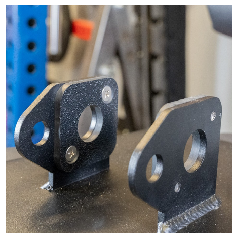
Plastic to protect post/spotter arm