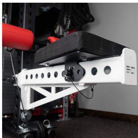
Attach to spotter arm for seat