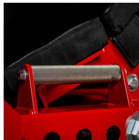
Stainless Steel Knurled Handles