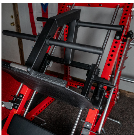
4 Loading Pegs and 4 Weight Pegs