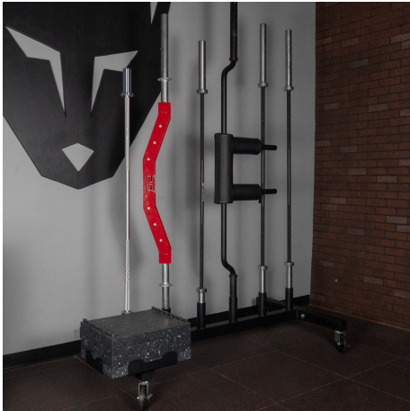
Add To Combat Hex Bar Storage for portable storage