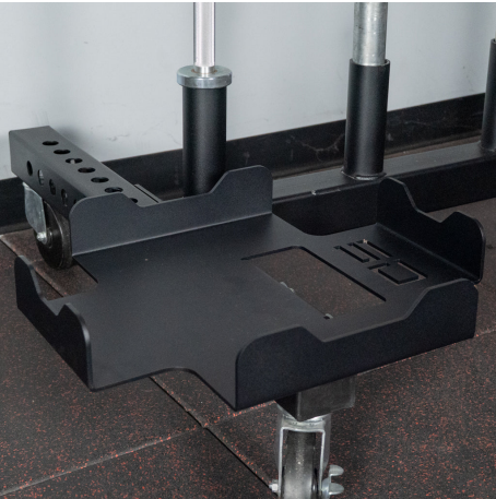
Add To Crossmembers