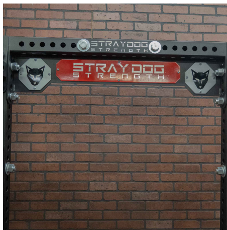
Always comes with small SD Logo Plate