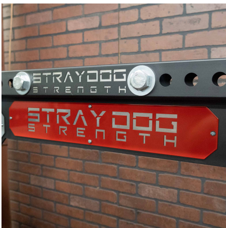
Custom Name Plate