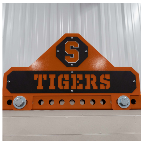
Laser Cut Logo Option