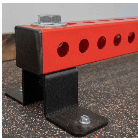
Bracket puts tube 3" off ground