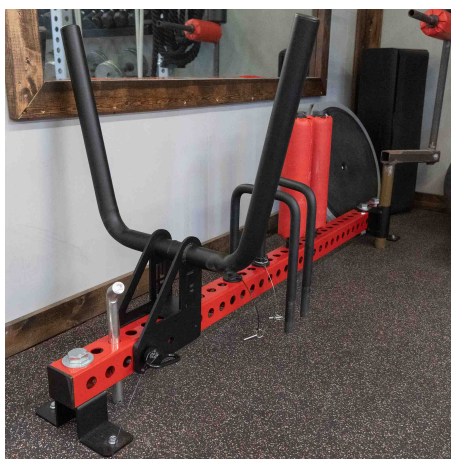
Store Attachments or Bars