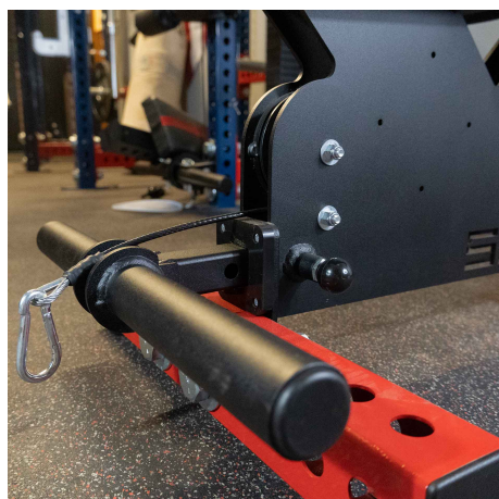
Adjustable Low Row Foot Peg