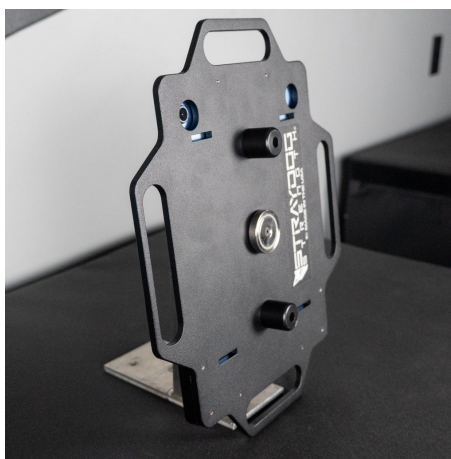
Magnet and 1" Nubs