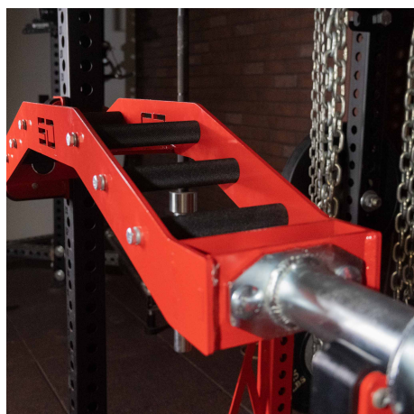
Color Options Available (5+ Bars)