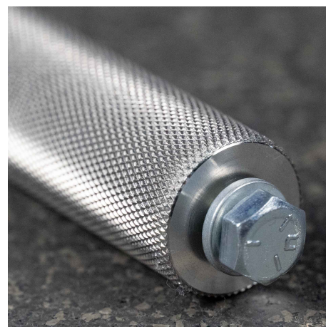
Stainless Steel Knurled Handles