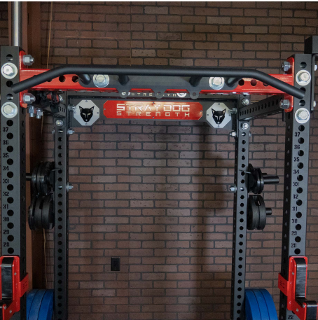
Black Texture Paint for grip