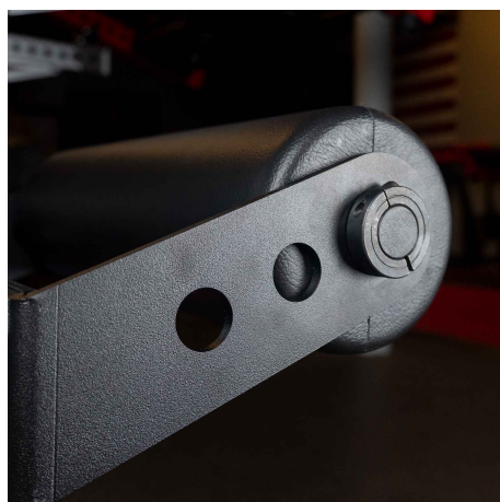
3 Depth Settings