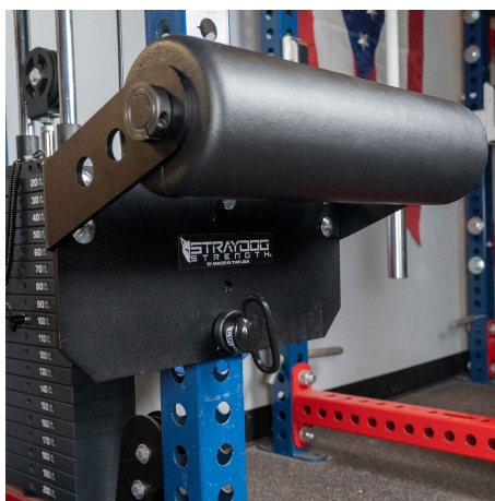
1" and 5/8" Holes