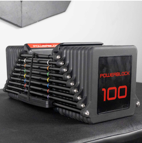
50, 100 and 125 LBS Options