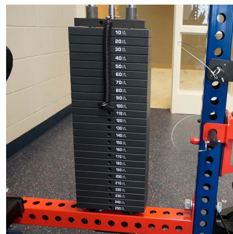
1:1 Ratio weight Stack