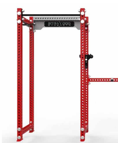
Alpha Half Rack