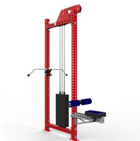
ATR Lat Pull Down