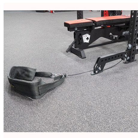
Attaches with Carabiner