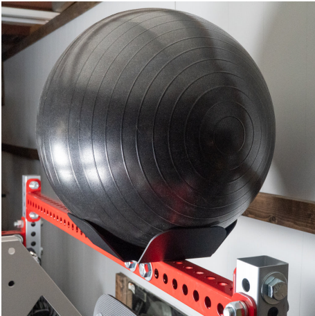
Fits Stability Balls