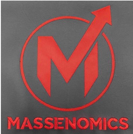
Ability To Replace overtime