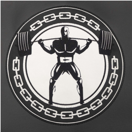
Black Upholstery Only