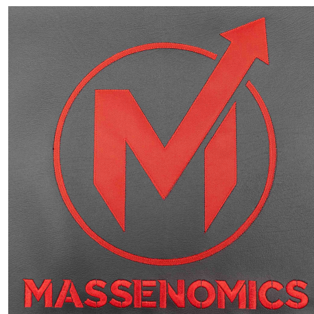
Ability To Replace overtime