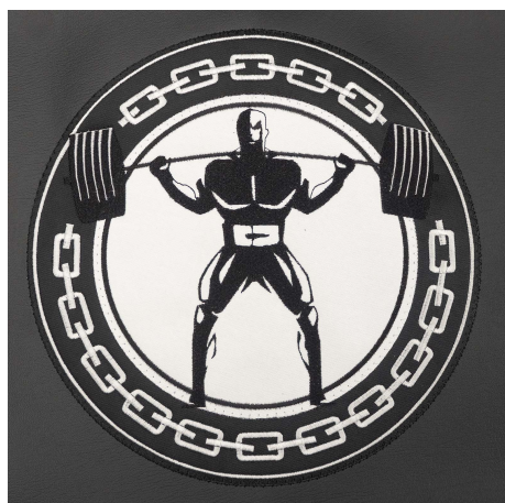
Black Upholstery Only