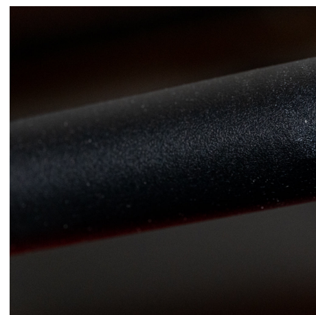
Black Texture Finish