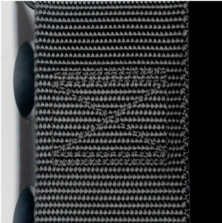
Strong Nylon Construction