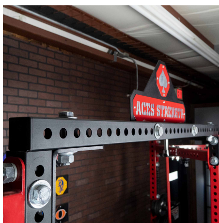
3x3 11 Gauge Steel Tube