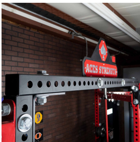
3x3 11 Gauge Steel Tube