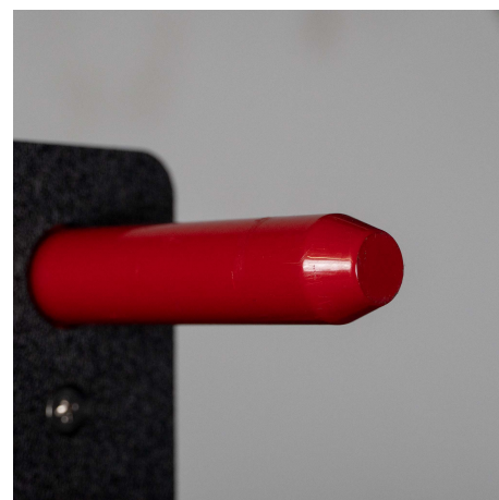
Tapered Pin for easy adjustment