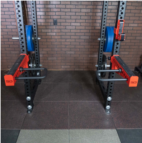
Attach To spotter arms