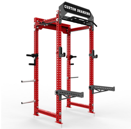
Mount to Front of Rack