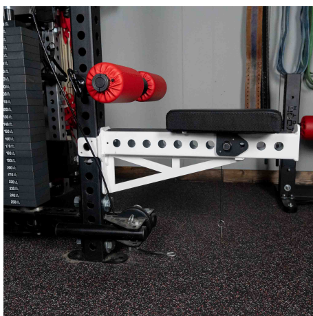
Removable Seat and Knee Hold