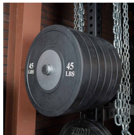
6 45 LBS Bumpers per Peg