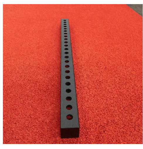
Non Offset 1" Holes on all 4 sides