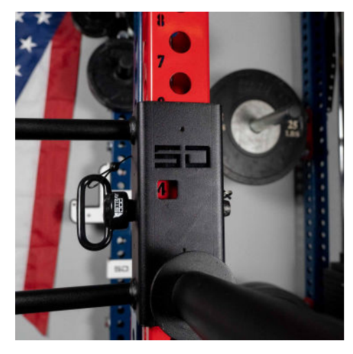
Number Cut Out