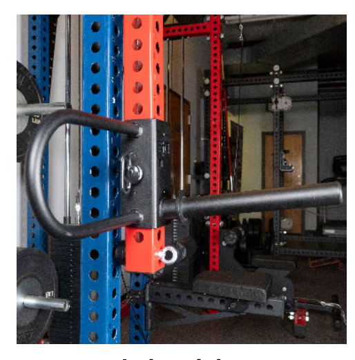
Angled Weight Peg