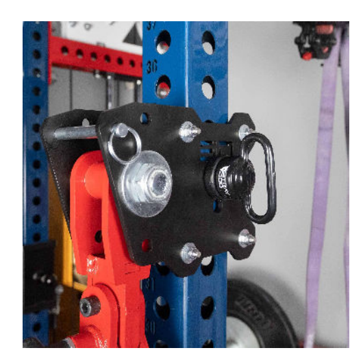
Bracket with Rollers